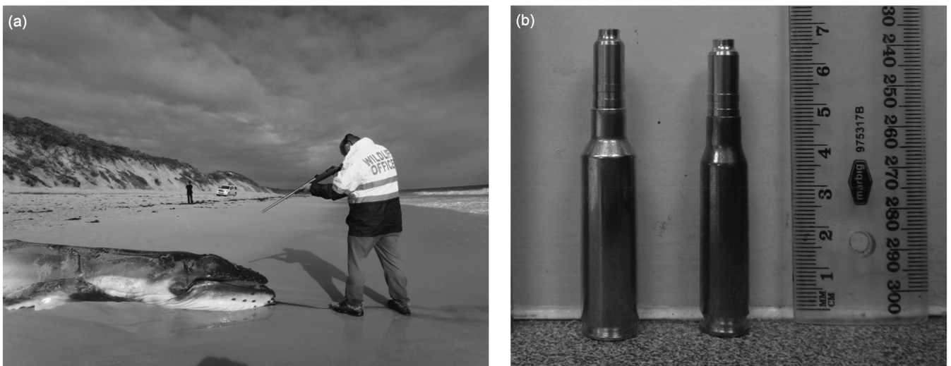
Fig. 1. Standardised shooting methodology used in this study. (a) Standardised shooting technique for post-mortem ballistic testing on a neonate humpback whale ( Megaptera novaeangliae ) in ventral recumbency. (b) The non-traditional design of the .30 calibre blunt solid copper-alloy non-deforming Woodleigh hydrostatic projectiles used for standardised shooting. The shell casings are .300 Winchester Short Magnum (left) and .308 Winchester (right).

All rifles fired the same projectiles; 12g/180 grain Woodleigh hydrostatically stabilised blunt non-deforming solid bullets (Table 1; Fig. 1b). These projectiles are constructed from copper-alloy (see Thomas, 2013) and have been developed to allow deep tissue penetration in large, thick-boned game species. These projectiles were chosen on the basis that blunt-nosed non-deforming projectiles have previously been shown to successfully penetrate cetacean craniums (Øen and Knudsen, 2007) while shotgun solids,