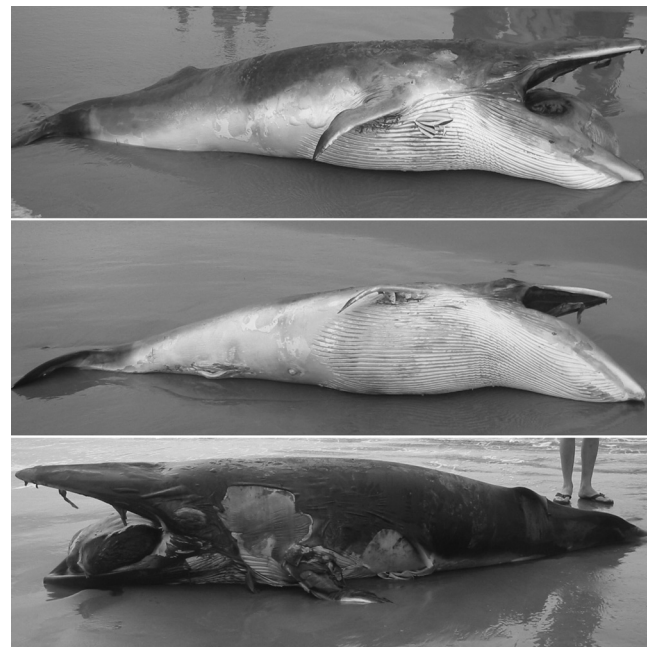
Fig. 2. Different views of the specimen of B. bonaerensis stranded at San Pablo, Ecuador.

the flanks three major light greyish streaks in a waved pattern were observed extending from the lower part up to the mid flank; one located in front of the dorsal fin, another one in thoracic area and a smaller one over the flipper. Another light grey streak was also visible in the caudal area. Two irregular and light grey streaks extended from the blowholes rearward and to left side of the body (Fig. 3). Ventrally, most of the epidermis was lost and the specimen looked whitish and slightly pink in the ventral and genital area. The skin at the