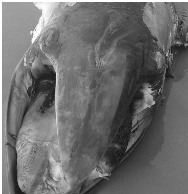
Fig. 3. Rostrum and upper part of the head showing the central keel and the two blowhole streaks.

(Fig. 3). Most plates had a dark grey external border in the upper part and white tips, particularly along the posterior and central parts of the row. Border plates became lighter towards the tip, changing from dark grey to a red colour, to cream-white. Due to the colour transition on the external border of the row, plates were separated into three colour categories: (1) all white, cream-white plates located in the tip of the row ( n = 45 , 17%); (2) mostly reddish, behind the white part ( n = 33 , 12.4%); and mostly dark grey (the remaining from the original count, n = 172 , 64.9%). These numbers should be dealt with cautiously as they were qualitatively estimated from photographs. Over time the plates have lost their original colouration, becoming lighter due to the preservation media. This colouration pattern is no longer visible. The largest individual baleen plate was 81mm, measured on the external side from the gum to the beginning of the bristles, and its width was 59mm, measured along the base of the gum, which gives a proportion width/length of 0.73.