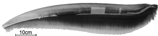
Fig. 4. Left baleen plates row curated at the Museo de Ballenas in Salinas, Ecuador. Colour photos available online ( www.iwc.int/publications ) shows the original colour when the piece was collected.

Most morphological characteristics that could be evaluated in the Ecuadorian specimen coincided with detailed descriptions of Antarctic minke whales, including the number of ventral grooves, lack of the white flipper patch,