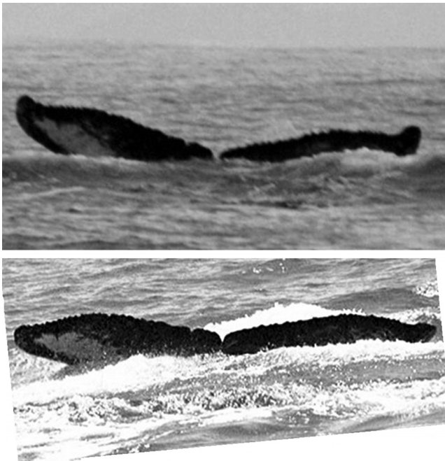
Fig. 1. AHWC#0664 photographed off Salinas, Ecuador in 1996 accompanied by a calf of the year (top – Museo de Ballenas photograph) and on Abrolhos Bank, Brazil in 1998 (bottom – IBJ photograph).

While it is not clear what physical or social cues humpback whales use to identify breeding habitat, nor how they navigate, they are able to follow remarkably direct