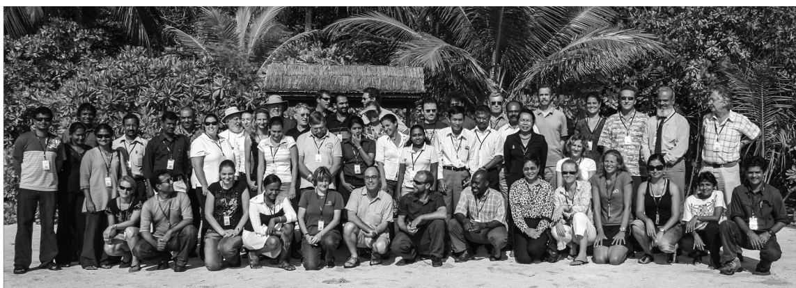
Fig. 2. Participants at the Indian Ocean Cetacean Symposium, Paradise Island Resort, Lankanfinolhu Island, Maldives, July 2009.

Marine Research Centre, Maldives ( www.mrc.gov.mv ); the US Marine Mammal Commission ( www.mmc.gov ); Save our Seas Foundation ( www.saveourseas.com ); the Animal Welfare Institute, USA ( www.awionline.org ); the Atoll Ecosystem Conservation Project, Maldives ( www.biodiversity.mv ); the Bay of Bengal Large Marine Ecosystem Project ( www.boblme.org ); the Bay of Bengal Programme Inter-Governmental Organisation ( www.bobpigo.org ); Conrad Maldives Rangali Island ( www.conradmaldives.com ); Emirates Airlines, Maldives ( www.emirates.com ); Four Seasons Resort Maldives at Landaa Giraavaru ( www.fourseasons.com ); Paradise Island Resort and Spa, Maldives ( www.villahotels.com ); One & Only Reethi Rah, Maldives ( www.oneandonlyresorts.com ); Soneva Fushi by Six Senses, Maldives ( www.sixsenses.com ); and Villa Hotels, Maldives ( www.villahotels.com ).