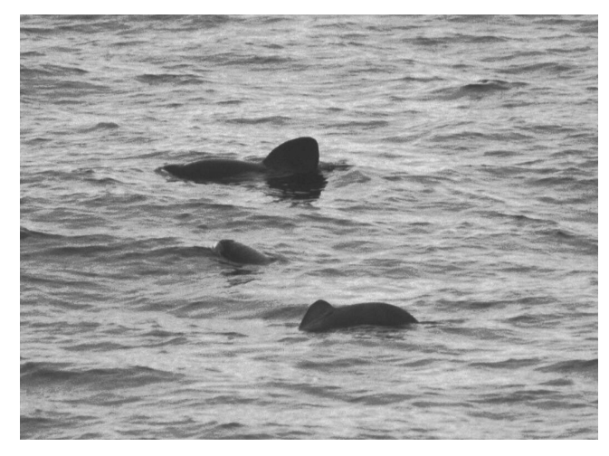
Fig. 2. A group of three spectacled porpoises observed on 25 December 2001 at 60°54.58'S; 133°18.34'E. The group contained an adult male (background), showing the prominent dorsal fin, a cow and a calf.