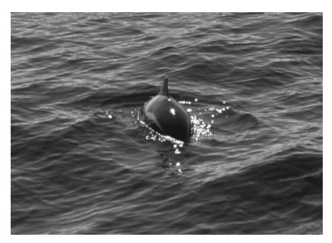
Fig. 6. An adult male showing a broad dorsal fin observed on 8 January 2004 at 61°39.49'S; 177°17.69'W. Note the light colour 'saddle' around the dorsal fin.