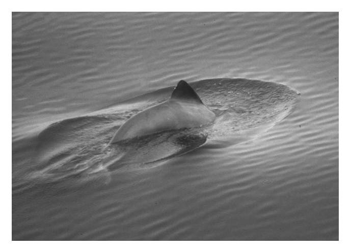
Fig. 4. A single spectacled porpoise (an adult female or a juvenile male) sighted on 24 December 2003, 58°17.21'S; 173°51.98'E. Note the light colour saddle around the base of the dorsal fin.

Spectacled porpoises were readily identifiable by their small size, black and white pigmentation and, especially the remarkable dimorphism in the size and shape of the dorsal fin (Figs 2-4). The dorsal fin of an adult female (i.e. attending a calf) was lower and triangular in comparison with an adult male, with the apex placed near the trailing edge of the fin; both the leading and trailing edge of the fin appeared to be slightly convex (Fig. 2 foreground) as Goodall and Schiavinni (1995) described. The massive, almost oval-shaped dorsal fin of the adult male was unmistakeable as it was substantially larger than that of the female or juvenile, being both broader and taller (Figs 2 and 3); (Bruch, 1916; Fraser, 1968; Goodall, 2002; Goodall and Schiavini, 1995). One individual had a dorsal fin larger than that of an adult female, but smaller than that of a matured adult male; therefore, it might have been an immature male (Fig. 4).