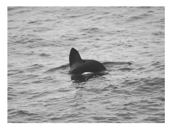
Fig. 3. Another view of the adult male on 25 December 2001 at 60°54.58'S; 133°18.34'E (Photo Sekiguchi).