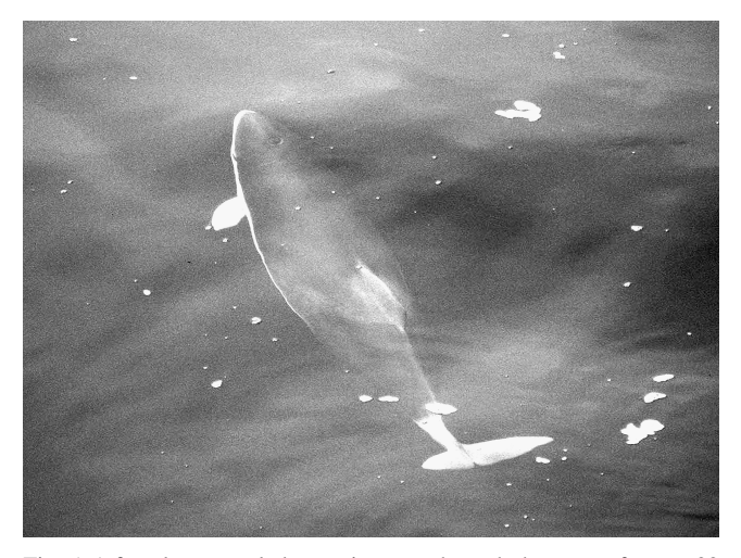
Fig. 5. A female spectacled porpoise seen through the sea surface on 22 December 2001 at 50°53.16'S; 142°45.88'E. Note the white ventral surface, white lips and 'spectacles'. The light colour of 'the saddle' around the dorsal fin is clearly visible through the water.