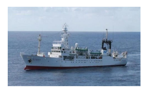
Figure 1. Research vessels participating in the dedicated sighting surveys in 2023 in the North Pacific: A) Yushin-Maru , B) Kaiyo-Maru No. 7.