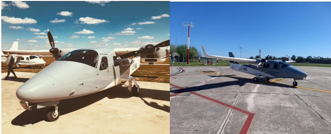
Figure 1: Aircraft used for aerial surveys

The aircraft used was a twin-wing Tecnam P2006T Twin MkII twin-engine (Fig. 1). The P2006T Twin MkII works with fuel savings and noise emissions much lower than other previously used aircraft, such as the Cessna 337 Super-Skymaster. On flights made the dolphins, and in particular the franciscana, did not react to engine noise, which happened with the Cessna 337 (Crespo et al., 2010).