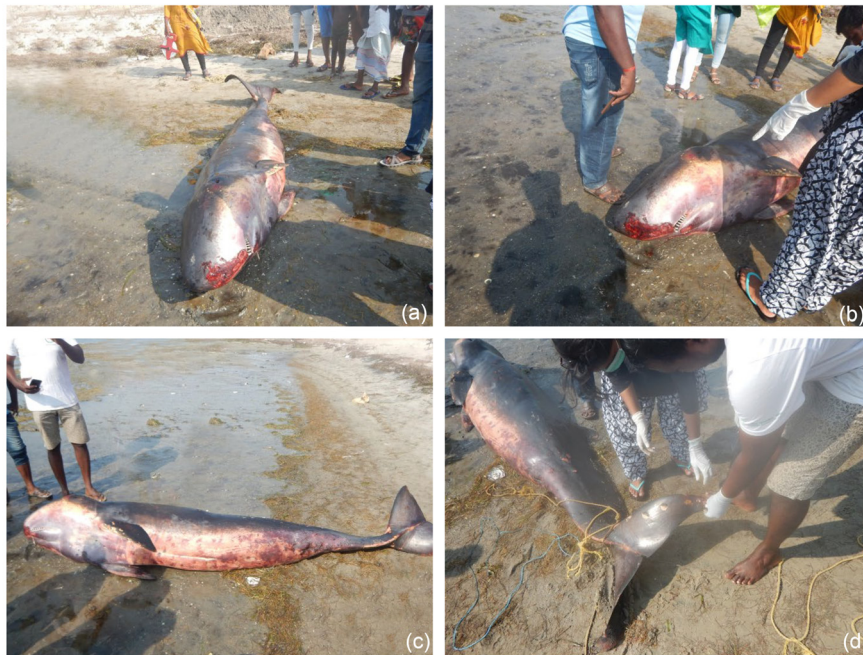
Fig. 2. Stranded specimen of Kogia breviceps (a) Fresh specimen washed ashore, (b) head with injuries due to probable ship or fishing vessel strike, (c) ventral side with many injuries probably due to entanglement in fishing rope/net, (d) Fishing net entangled on the fluke.

sequences based K2P genetic distance between K. breviceps and K. sima is 10%. Although several publications (e.g. Jerdon, 1867; Molur et al. , 1998) indicated the presence of Kogia species from Indian waters, much doubt has existed about their identification (Moses, 1947; Pillay, 1926; De Silva, 1987) with very few studies conducted on molecular sequences. Our results based on a partial mitochondrial COI sequence along with classical taxonomy provide a reliable species identification tool for pygmy sperm whale.