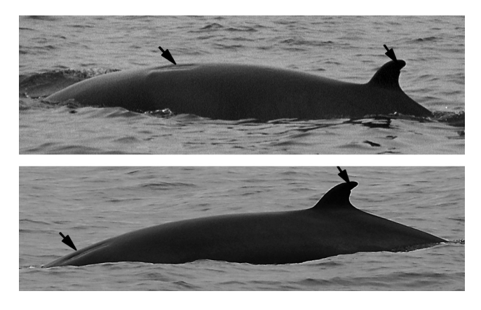
Fig. 3. Photograph of a minke whale (DEM24) sighted first in Skjálfandi Bay in July 2002, re-sighted in Faxaflói Bay (DEM162) in April 2010.

At present, a crude minimum estimate of identifiable animals (i.e. those with distinctive characters) for the two study areas is just over 350 over the study period - this does not take into account births/deaths or immigration/ emigration, the level of effort, the size of the study and the fact that not all whales are identifiable. With additional data it should be possible to undertake quantitative markrecapture analyses to obtain abundance estimates of the number of identifiable animals that use the study areas. Information from aerial surveys reveals that the whales' distribution is much larger than the present study areas. For example, the study area within Faxaflói represents only a small part of Faxaflói, which according to previous sighting surveys exhibits a uniform distribution of minke whales and peak abundances of up to seven thousand animals (7,678, 95% Cl: 4,984 to 11,830) in the summer (stratum 1 of table 2 in Borchers et al., 2009). Aerial survey results also confirm our general findings that more common minke whales use Faxaflói than Skjálfandi (Pike et al., 2009b).