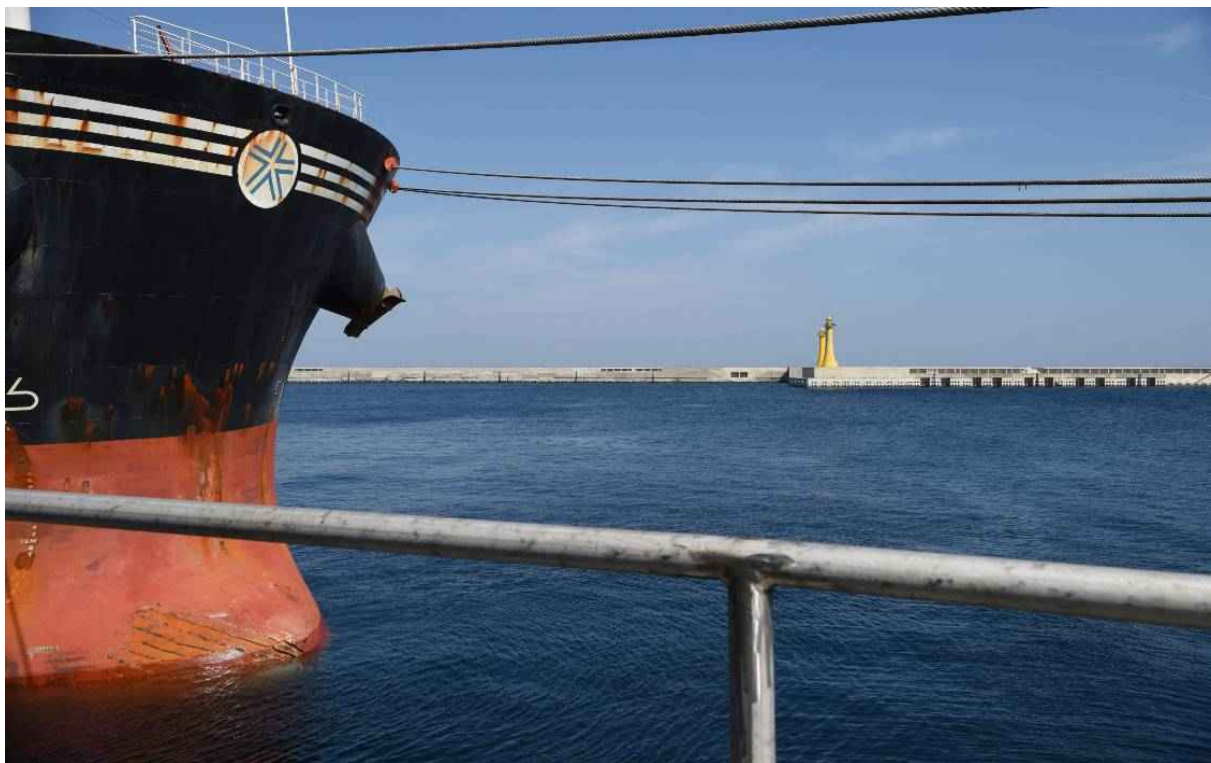
Figure 2. Port facility of the Samcheok Thermal Power Plant (37°17'N, 129°37'E , 13 th , Mar, 2018).