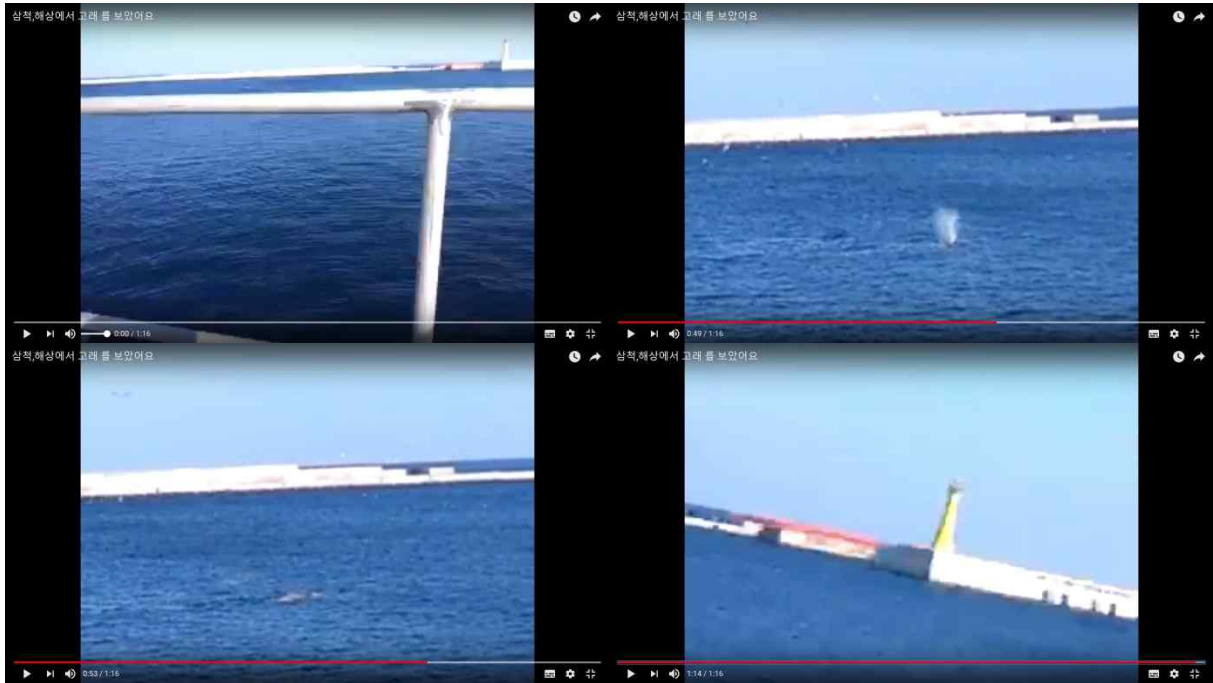
Figure 1. The captured images of the YouTube video clip.