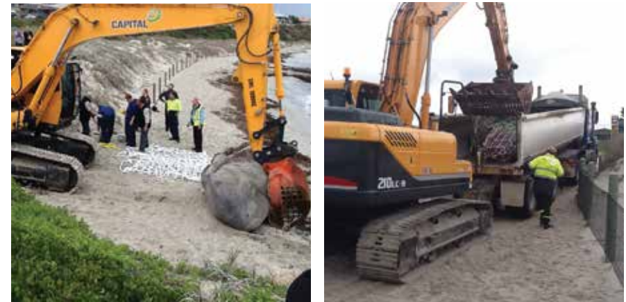
Left: Beach side before securing the whale carcass. Right: Placing the secured carcass in a truck for disposal.

Carcasses up to 12m (around 26 tonnes) can be transported in a semi-tipper truck. Larger animals should be floated on a low loader. Alternatively you can apply to the Department of Transport for an overweight load permit. Loads of up to 45 tonnes can be transported by mining equipment under permit.