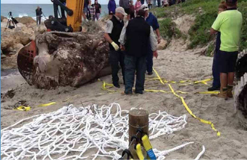
Removal team preparing the net array.