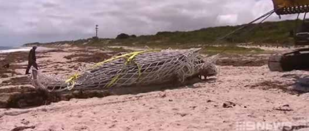
Secured whale carcass being dragged up the beach.