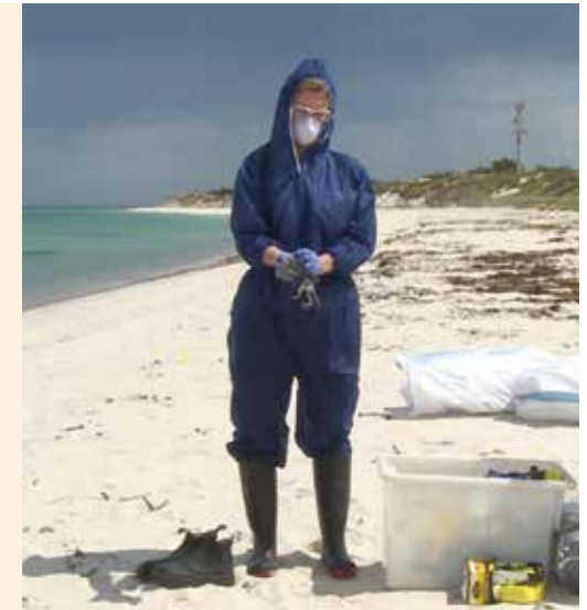
Before you start ensure PPE is worn.