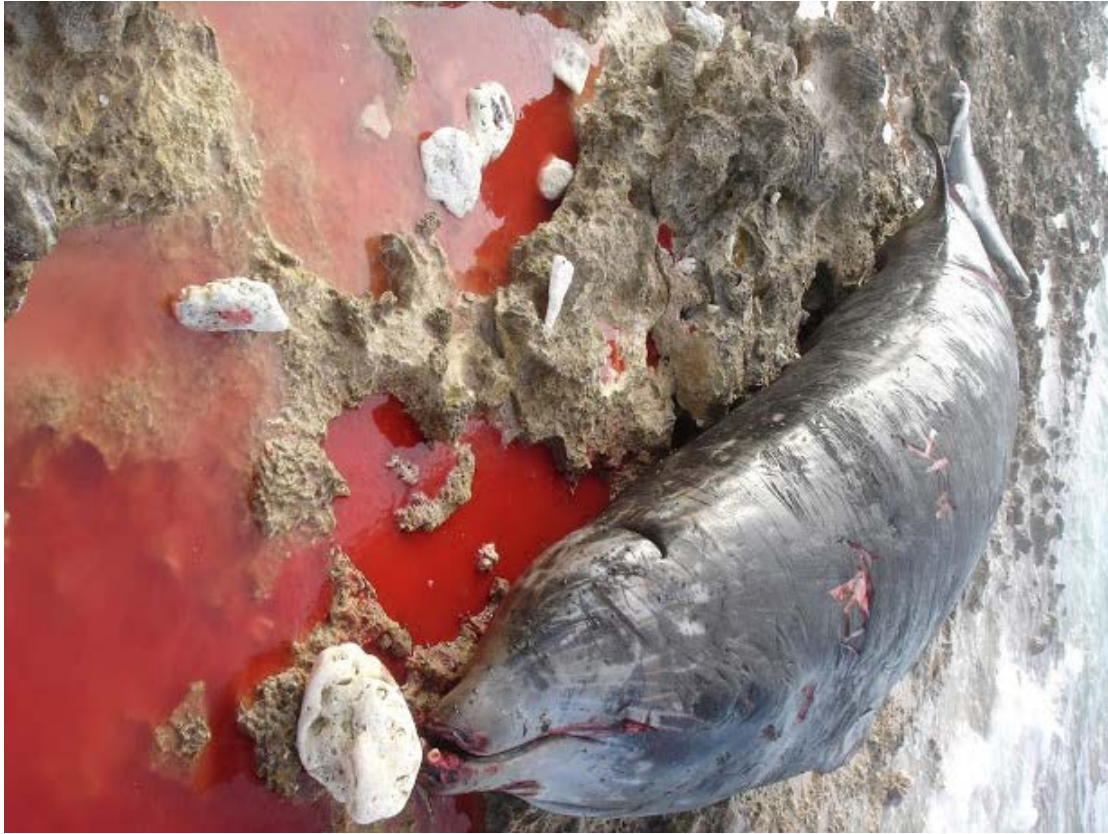
Fig. 2.