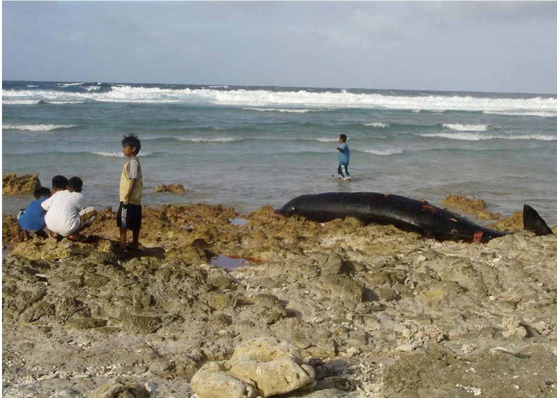
Fig. 3