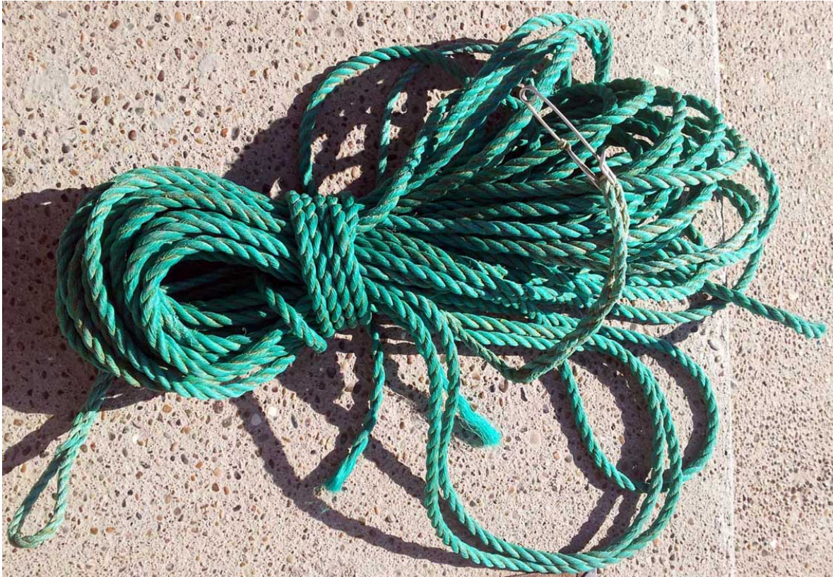
Case #13: Subadult Southern Right whale, sex unknown.