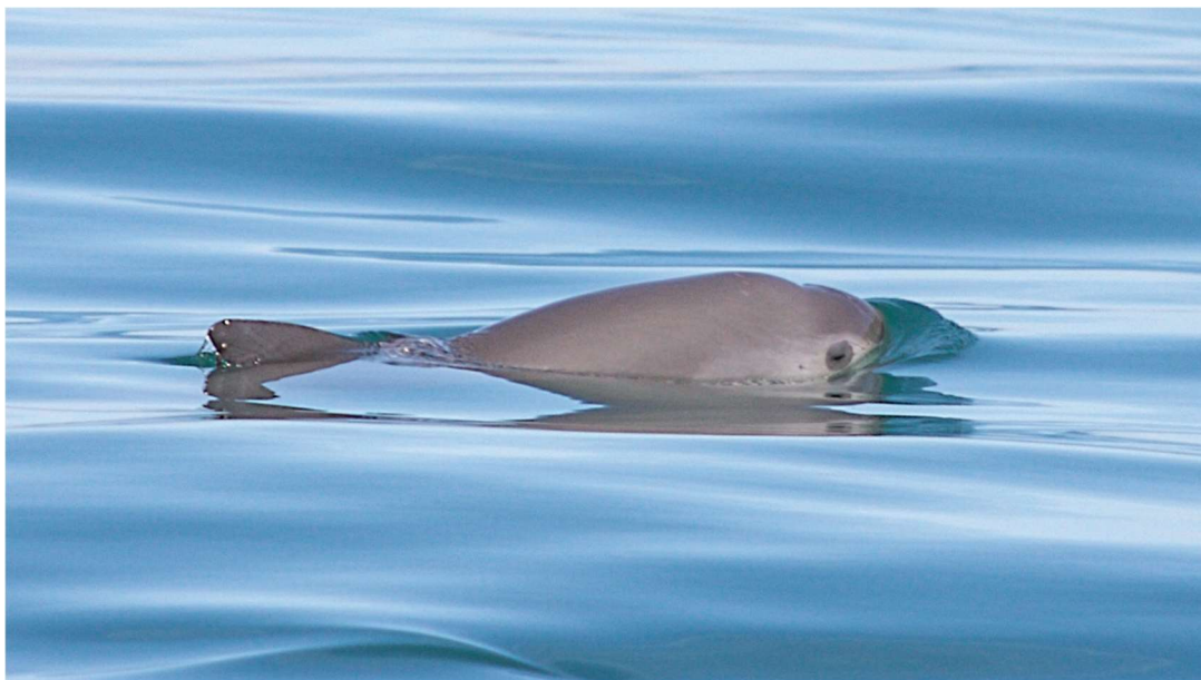
Wild vaquita displaying the characteristic dark eye-patch and shown in the glassy calm conditions needed to detect this cryptic porpoise species. October 2008.

Despite nearly thirty years of repeated warnings, the vaquita hovers on the edge of extinction due to gillnet entanglement.