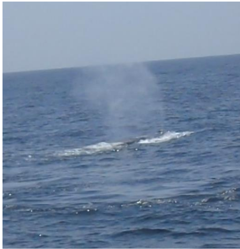
Fig. 3. Unidentified whale spout observed off Sapat

major part of the tuna fleet operates in coastal areas of Balochistan, thus frequency of sightings are much higher from the area.