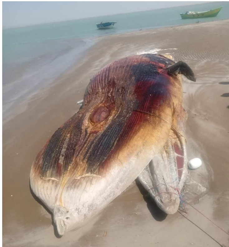
Fig. 2. Bryde's whale stranded at Sirki (Kalmat Khor) on 21 October, 2021

fuel and low prices of tuna in Karachi. Operating from Gwadar enables them to sell their catch directly to Iranian traders and also get cheaper Iranian diesel. Obtaining information from observers about whale sightings is difficult because of limited communication facilities available in Gwadar