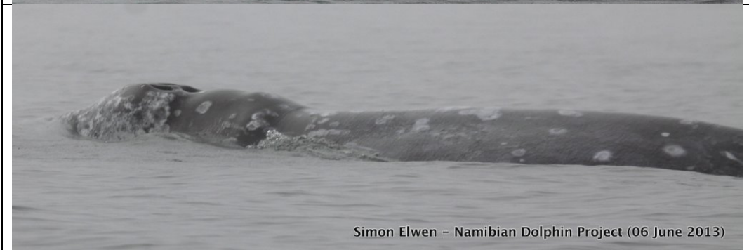
Figure 2. Images showing the head and left flank of the gray whale encountered in Walvis Bay Namibia on the day it was photographically confirmed (05 May 2013) and one month later (06 June 2013)