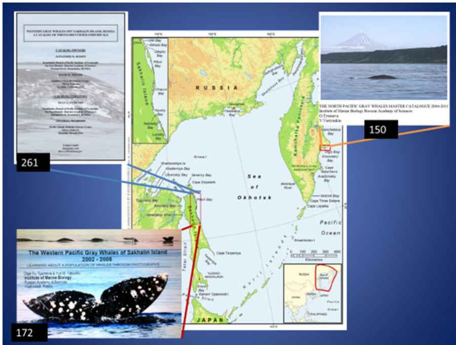
Figure 1. Photographic catalogues from the feeding areas in Russia